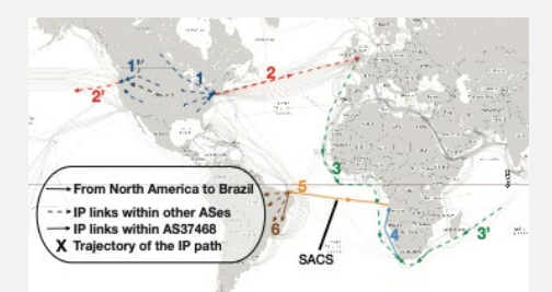
Figure 1: North America Paths routed through Africa to Brazil

Paths taken from North American Ark nodes to Brazil that transited Africa after deployment of the SACS Brazil-