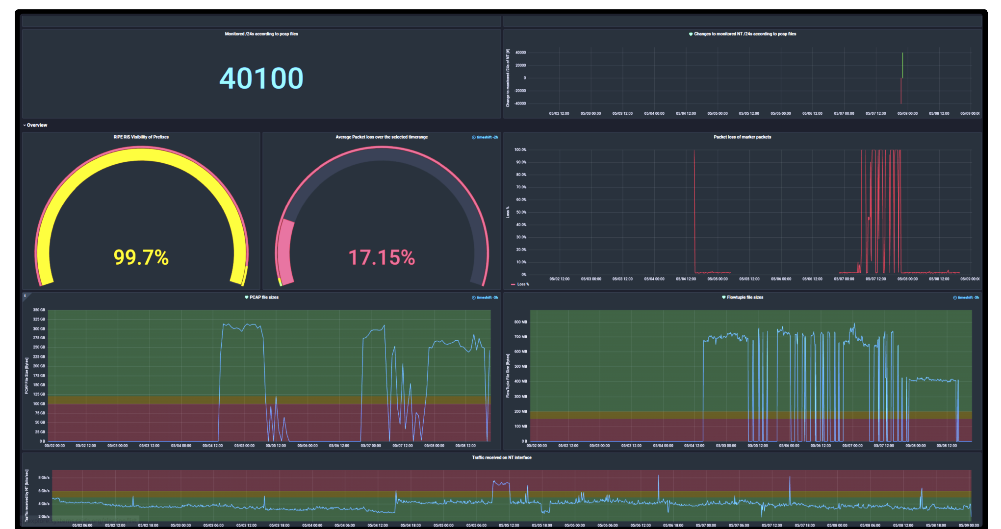
A screenshot of UCSD-NT monitor dashboard with alerting functions to reduce our reaction time to system issues