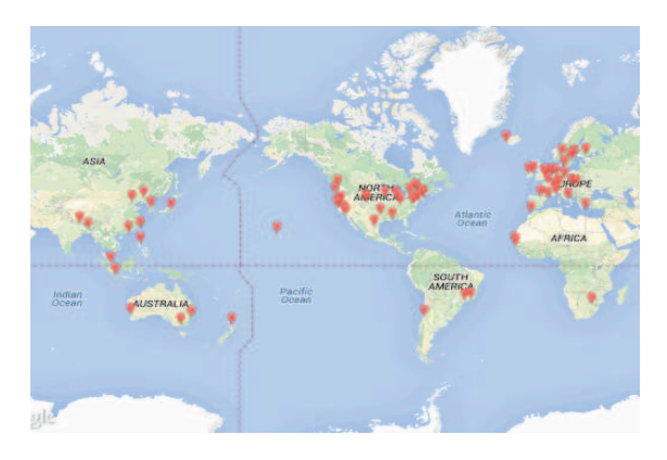
Figure 2: As of November 2013, there are 83 Ark monitors in 36 countries.

to access the data. This flexibility will help us evaluate how the trade-off between BGP monitoring latency and coverage impact our methodology.